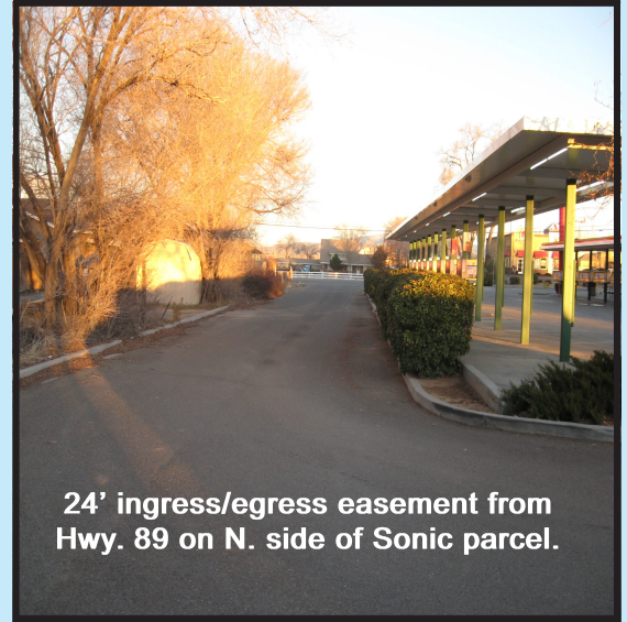
24' ingress/egress easement from Hwy. 89 on N. side of Sonic parcel.