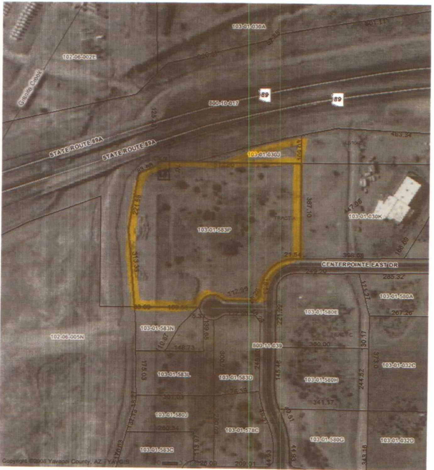
Map scale = 1:2888